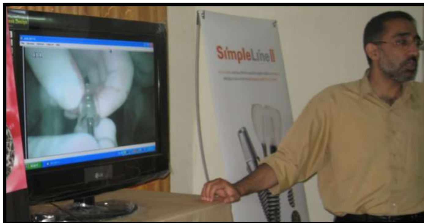
Picking up the implant from its container