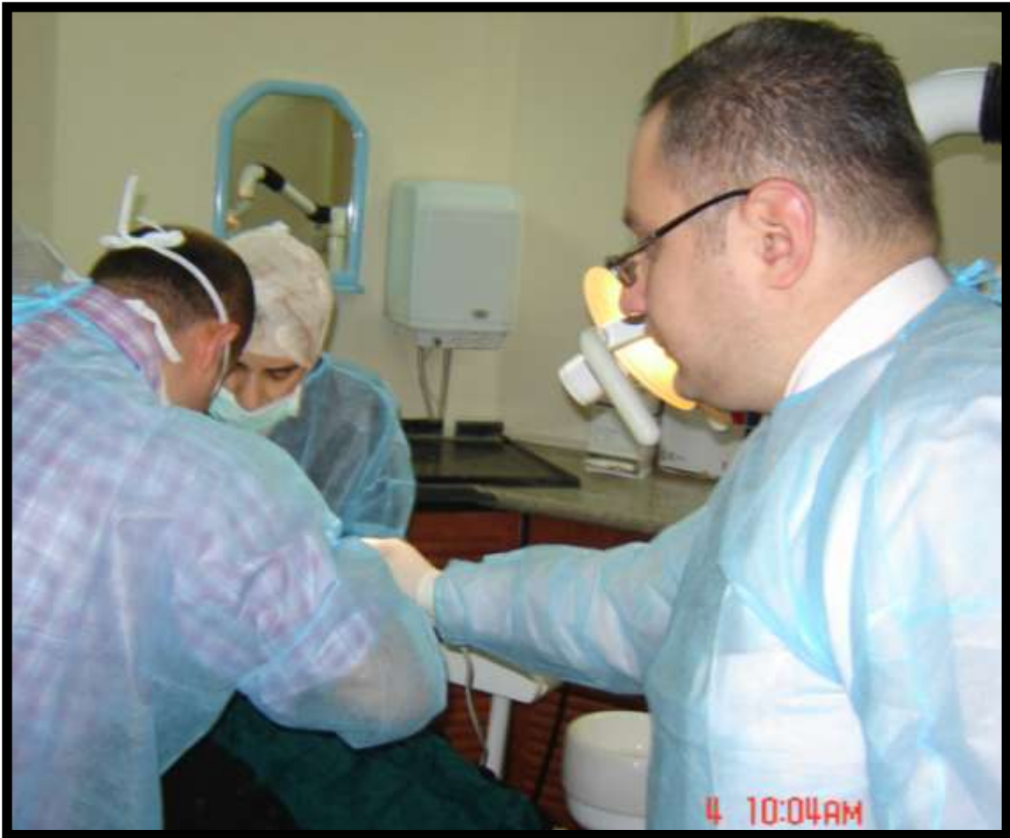
10:00AM : Surgeries for the 2 nd day continues.