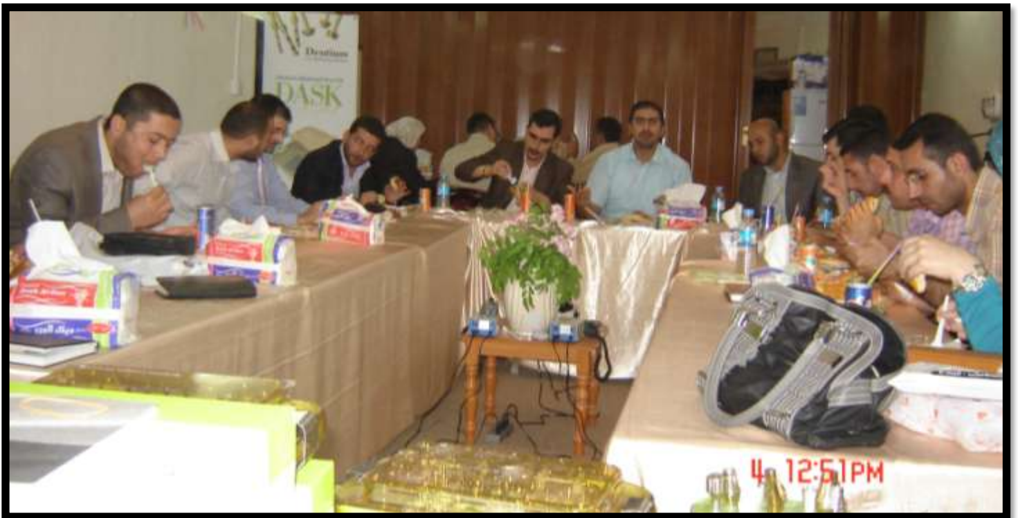
The surgeries continued until 1:00PM (lunch time)