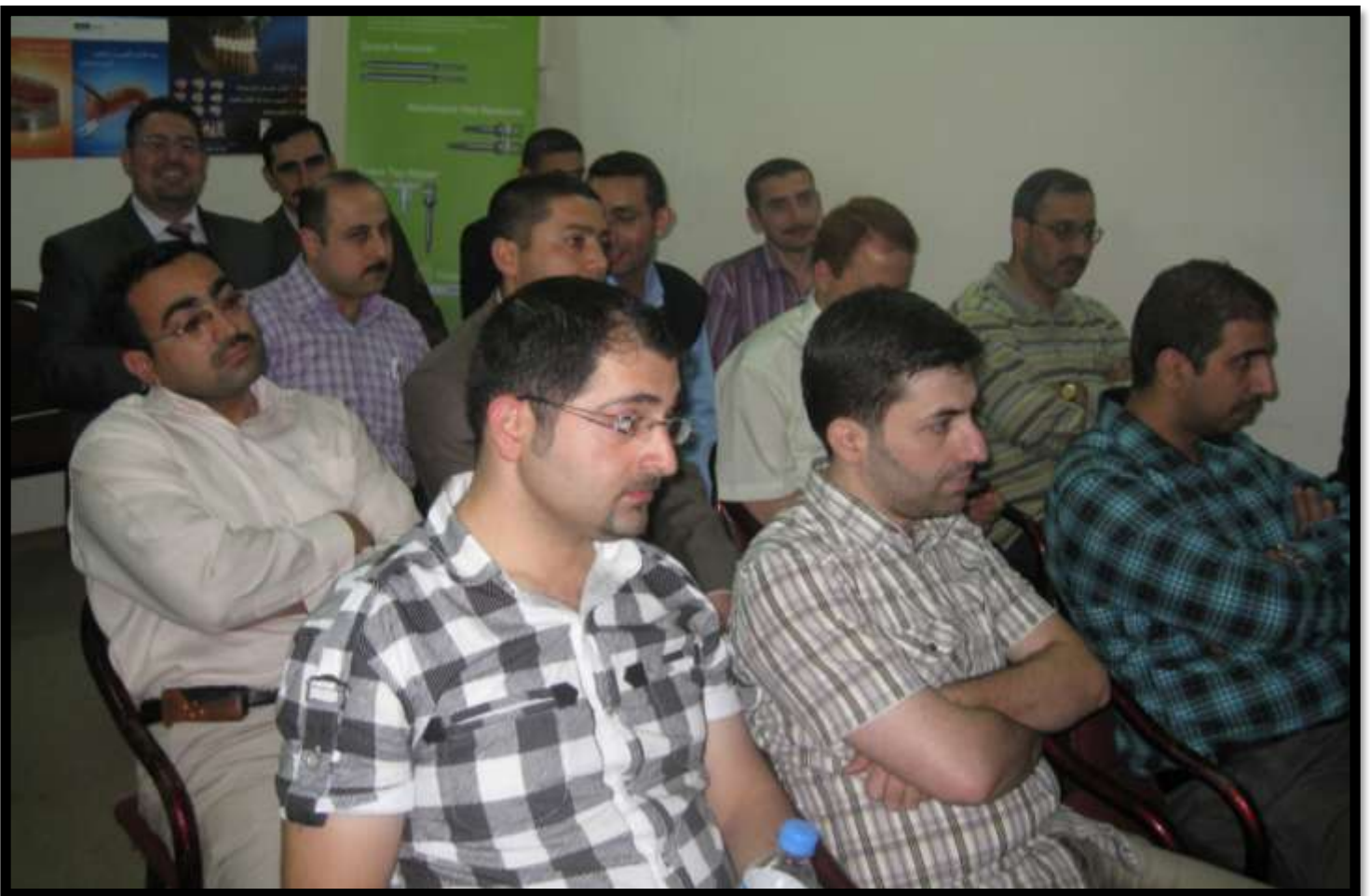
1:15PM Entering live Surgery observation room.