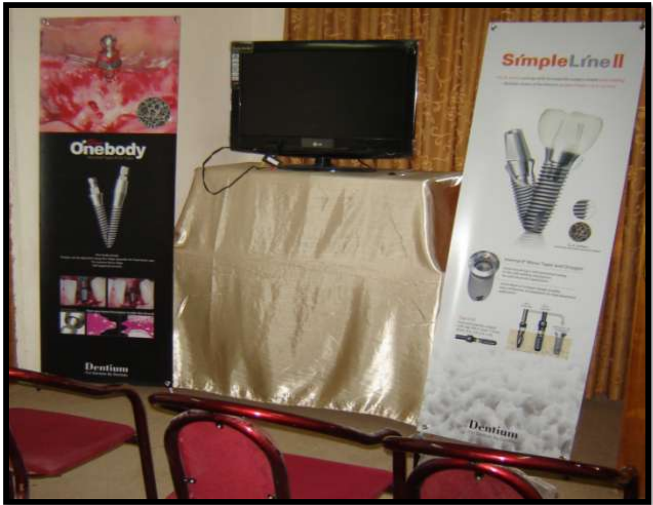
Live Surgery Observation Room