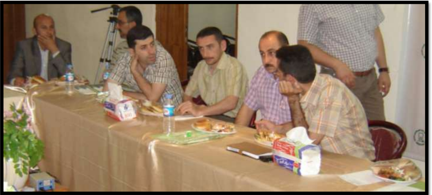
12:30PM lunch time