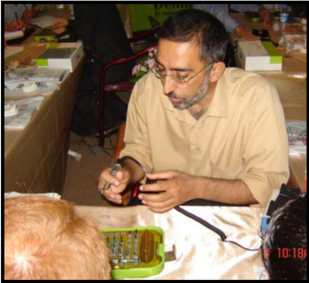
Photo gallery from the workshop