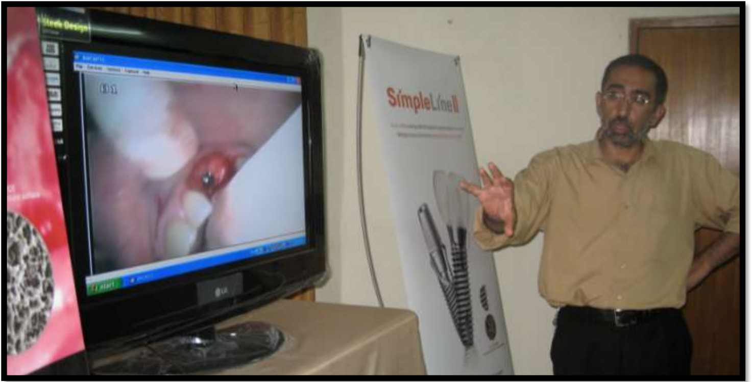
Installing the cover screw