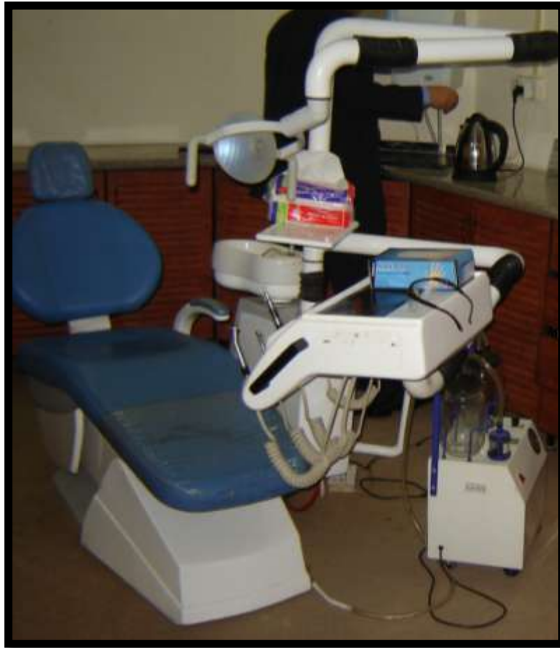
The Clinic of O.D.C.I.A.