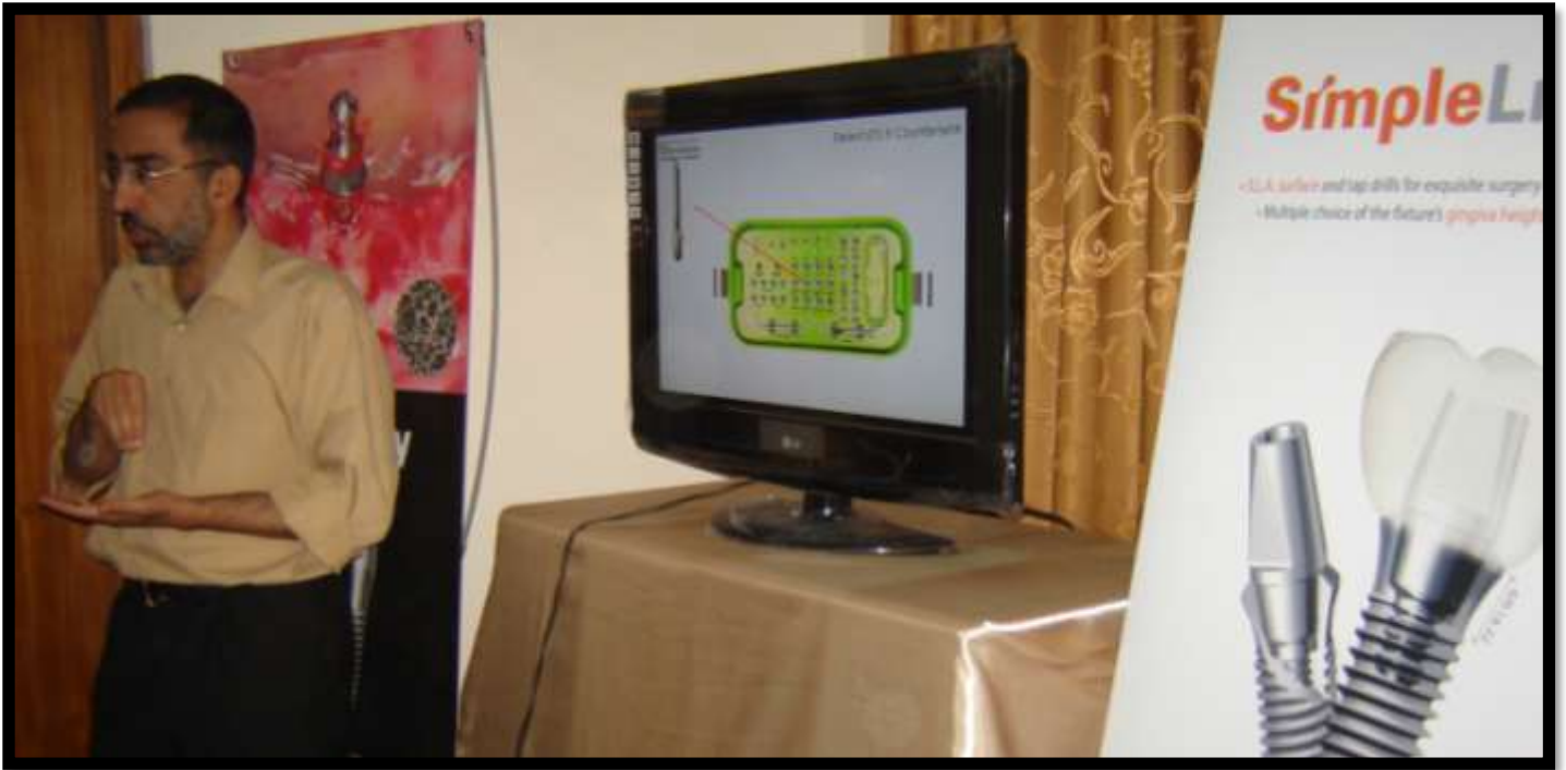
Dr.Bashar reviewing the surgical steps with the trainers.