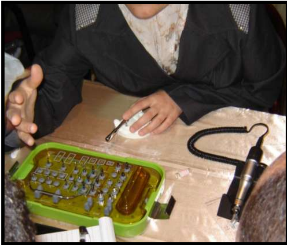
Photo gallery from the workshop