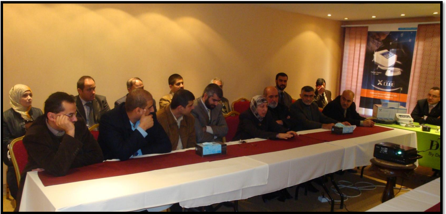
11:15 AM – 11:30 AM Discussion & Teatime.