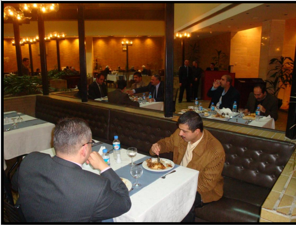
12:30 PM Lunch time (Open buffet)