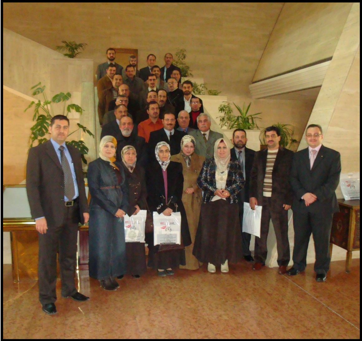
Final Group Photo